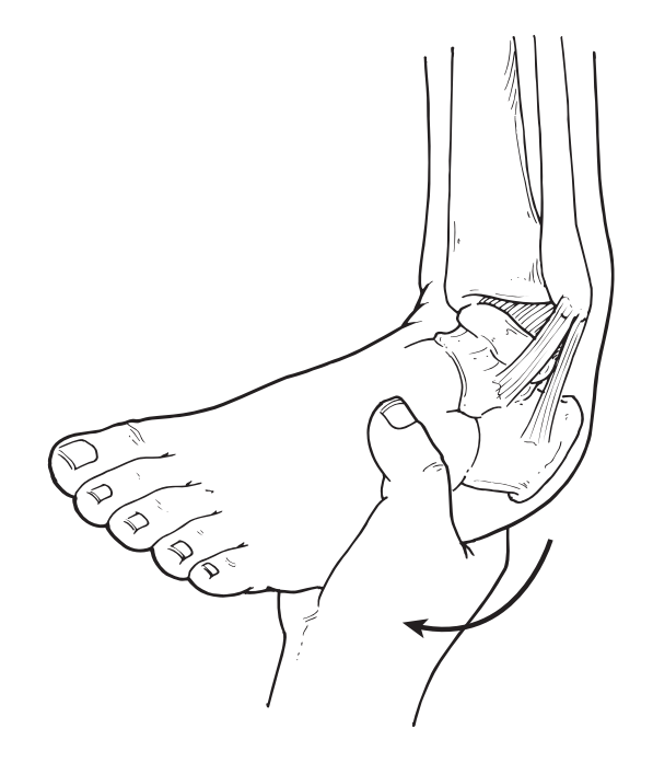
Examination technique: Chronic lateral ankle instability