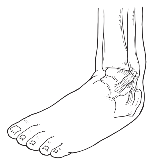
Injured ankle with laxity of ligaments

Chronic ankle instability usually develops following an ankle sprain that has not adequately healed or was not rehabilitated completely. When you sprain your ankle, the connective tissues (ligaments) are stretched or torn. The ability to balance is often affected. Proper rehabilitation is needed to strengthen the muscles around the ankle and "retrain" the tissues within the ankle that affect balance. Failure to do so may result in repeated ankle sprains.